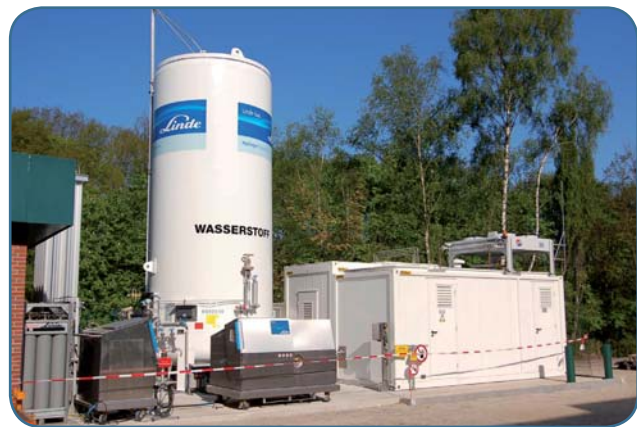
Zemships filling station at Hellbrookstraße

The liquefied hydrogen (LH 2 ) is delivered by trailer and filled into a super insulated storage tank at minus 253°C (minus 423°F). During the fuelling process, a vaporizer converts the hydrogen from liquid to gaseous, then it is compressed to 25 bar (360 psi) by a rotary screw compressor.