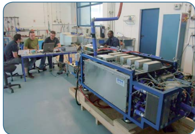
The ZEMships fuel cell system on the test bench at Proton Motor (May 2008).

With the PM basic A 50 maritime Proton Motor provides an efficient and robust hydrogen-fuelled fuel cell system, especially designed for the use in ships and boats. Its packaging and its functional design has been specifically adapted for maritime use, following the guidelines of Germanischer Lloyd for the use of fuel cells on board of ships and boats. The Germanische Lloyd has already performed the Factory Acceptance Test on the first system.